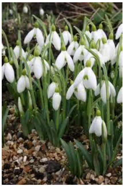
And look forward to